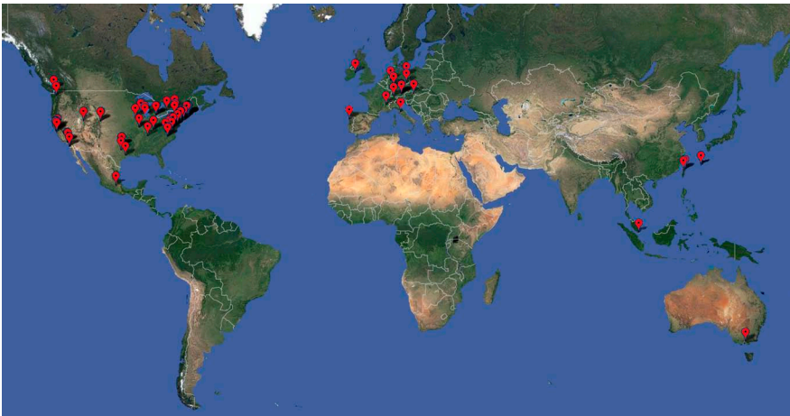
Figure 1. Worldwide distribution of SBGrid member laboratories as of May 2013. The SBGrid software library spans the spectrum of techniques commonly utilized by structural biologists, including X-ray crystallography, electron microscopy, NMR, 2D crystallography, bioinformatics, computational chemistry, small angle scattering, tomography, modelling, visualization and structure prediction.

members join SBGrid, all of the programs in the collection are installed and updated automatically and reside locally on member laboratory computers (see Box 2 ).