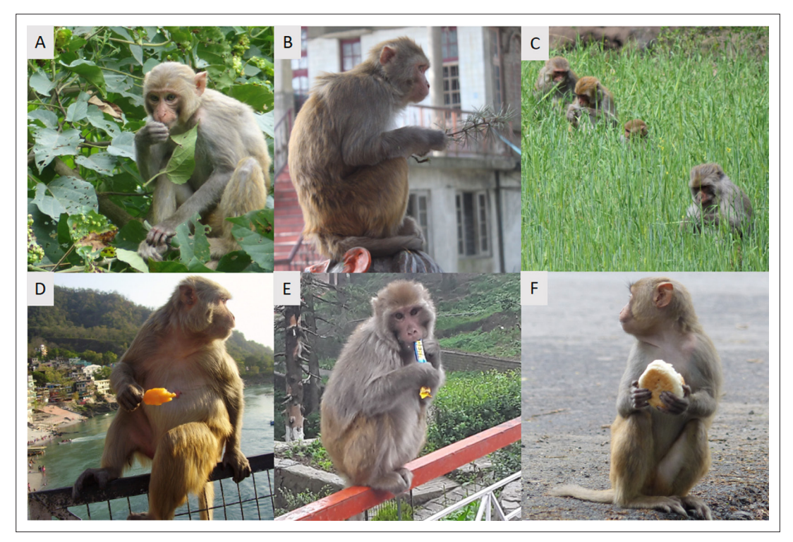
Figure 3. The diets of rhesus macaques can include both natural and anthropogenic food sources. Rhesus macaques are shown eating (A) Deciduous foliage in Buxa Tiger Reserve, West Bengal, India, (B) Conifer foliage in Shimla, India, (C) Wheat crop in an agricultural area of Himachal Pradesh, India, (D) A popsicle in Haridwar, India, (E) A candy bar in Shimla, India, (F) A tea bun in Buxa Tiger Reserve, West Bengal, India.