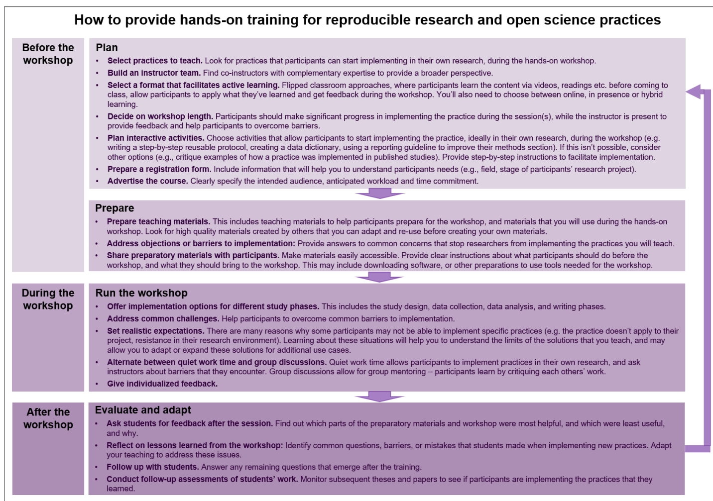
Figure 2. How to provide hands-on training for reproducible research and open science practices. The figure illustrates important points to consider before, during and after the training. Feedback and lessons learned from each training should be used to improve the next training session.

Course organization involves more than selecting the format and delivering content. You may need to advertise the event, invite participants, set up a registration site, organize a venue, make technical